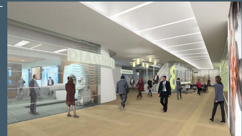
Showrooms on multiple floors organized by product neighborhood