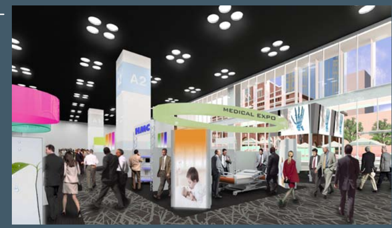
Expansive tradeshow hall for temporary events